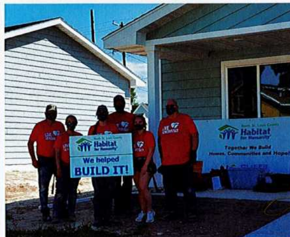
Detroit Lakes Trinity Lutheran members join us on 25th St E in Hibbing.