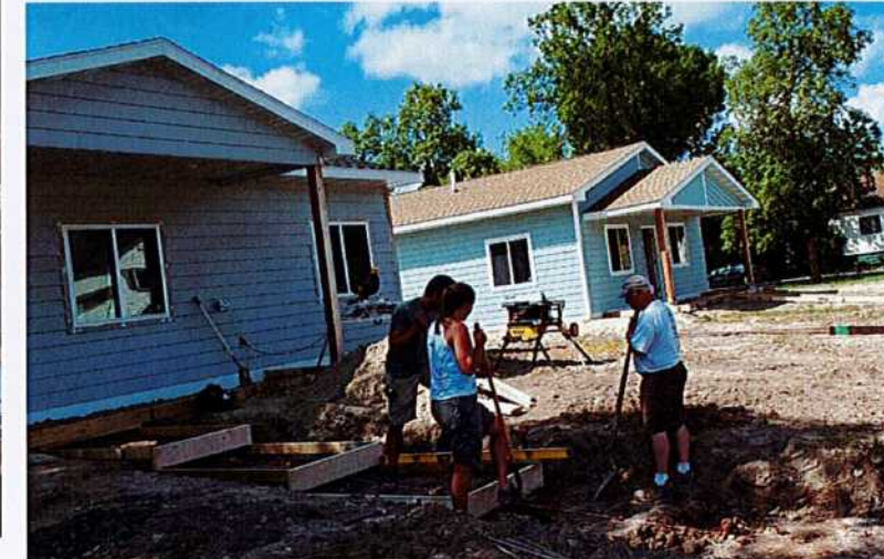
AmeriCorps members work with volunteers to set forms for sidewalks in Hibbing