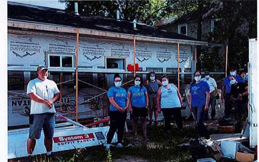
BCBS of MN volunteers install soffit and fascia on the Grovenburg home in Hibbing