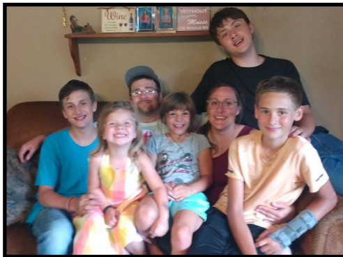
The Crandall Family