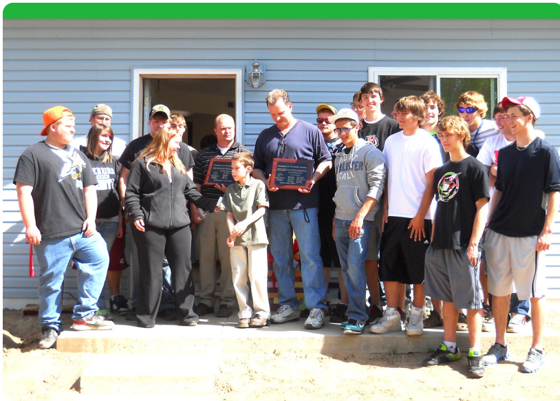
Hibbing and Chisholm High School Students receive NSLCHF's "Champions of Affordable Housing" award at the Putkonen's Home dedication in May 2012.

Little did we know as we gathered in a classroom in Hibbing in 2008 with school administrators and carpentry class teachers that this would be such a successful program. Minnesota's Applied Learning Institute was just getting off the ground and schools were looking at new ways to engage their students with hands on learning. It wasn't long into the meeting that we realized that partnering together to offer an excellent student learning experience while addressing our neighbors need for affordable housing would be a great match.