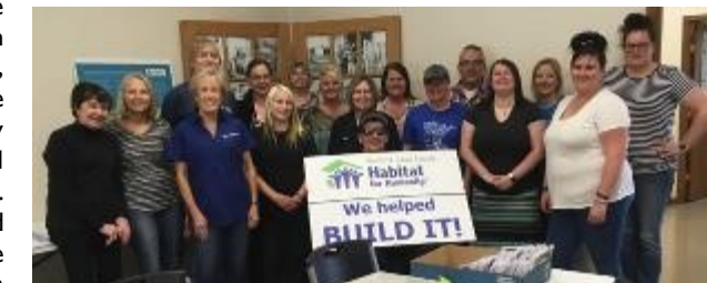
Partner family members, community volunteers, Soroptimists International of Virginia member and our great partners at Blue Cross Blue Shield prepared the Habitat 500 newsletter

If you come and help us prepare a newsletter or direct mailing, you experience a fun day of comradery with new and existing friends as you work. You also get the first, sneak peek at what is going on at Habitat! Maybe you help with the Habitat 500 newsletter, wherein you get to meet the new year's families. Maybe you helped with this newsletter, learning more about what our staff does and who we are as well as getting the scoop on our Habitat 500 and building experiences this summer.