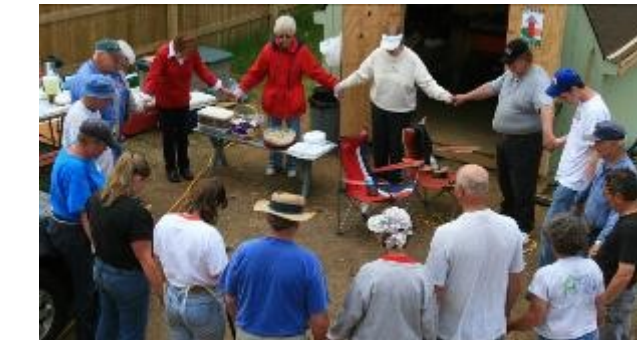
Construction volunteers pause for prayer before a hearty lunch

If you join our many prayer partners, you know your words of love and gratitude on behalf of our staff, our volunteers and, most especially, our families are helping to work miracles in our communities.