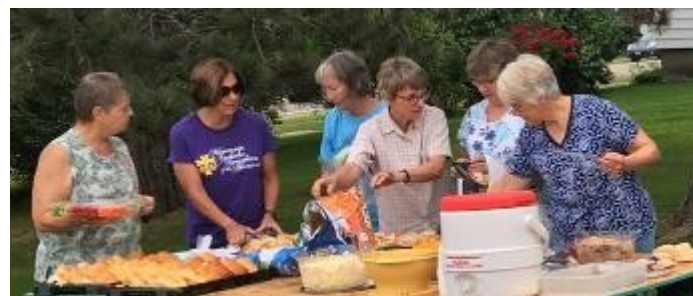
The Catholic Daughter of American, Eveleth, feeding a LARGE group of Habitat 500 riders in Eveleth

If you are willing and able to provide a lunch to our build volunteers, you are greeted at the site with cheers and gratitude and you, again, get to meet new friends and strengthen existing friendships. By providing a healthy and energizing meal, you are also helping to build a home and a community and, thereby, HOPE!