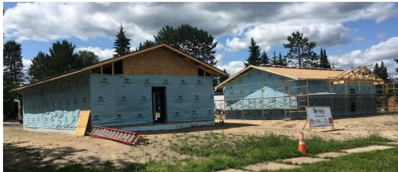
West Eveleth Homes Coming Along!