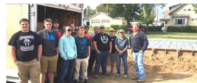
Colemer home, Chisholm