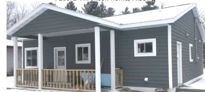
Olson-Koller home, Aurora