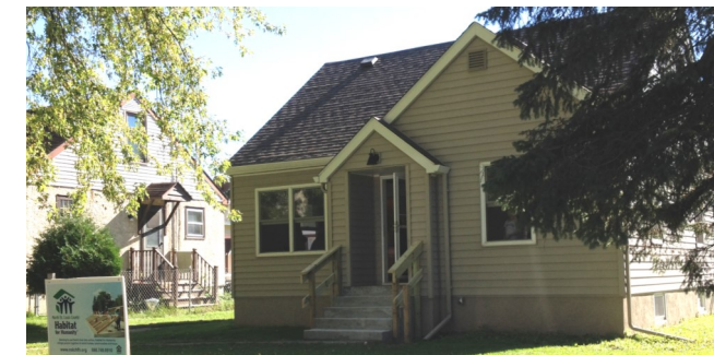
Dow home, Virginia

Please see our volunteer highlights at www.nslchfh.org under "Building Hope."