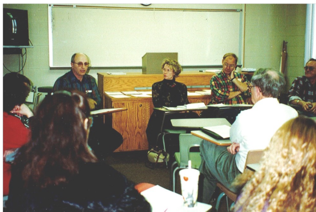
A Habitat for Humanity steering committee met in September 1994 to shape the future of Habitat's mission on the Iron Range.

today's choices to serve our neighbors in need through our support of Habitat's ministry, what will be the impact in the next 30 years? How many families will we have served? How many children's lives will be impacted by growing up in a safe and warm home? How many more will we inspire to serve others?