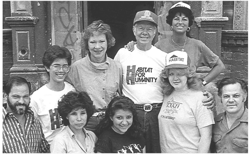
President Jimmy Carter, with former First Lady Rosalynn Carter to his right, at the first Carter Work Project in New York City in September 1984.

Since 1984, the Jimmy and Rosalynn Carter Work Project has touched lives around the world by inspiring more than 108,000 volunteers to help build, renovate, and repair 4,447 homes in 14 countries. Although they were not the founders of the Habitat organization, the Carters certainly inspired people to join in the work across the world, including here on the Iron Range.