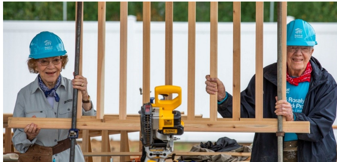
Rosalynn and Jimmy Carter at the 2018 Carter Work Project in South Bend and Mishawaka, Indiana.

Jimmy Carter (1924-2024) served as the United States' 39th president from 1977 to 1981. In March 1984, and former First Lady Rosalynn Carter (1927-2023) worked with Habitat in Americus, Georgia, near President Carter's hometown, Plains. They quickly realized that Habitat's mission closely aligned with their values, and a partnership was formed. Just a few months later, in September of that same year, the Carters led a Habitat for Humanity work group to New York, serving 19 families in need of safe, affordable housing.