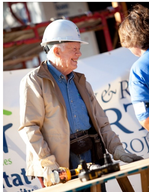
President Carter at the 2010 Jimmy and Rosalynn Carter Work Project in Minneapolis/St. Paul, 2010.